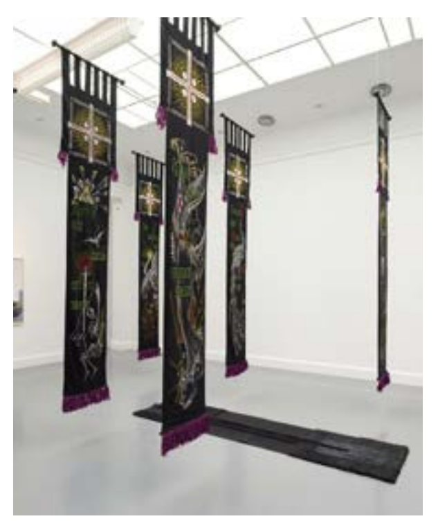
Broken White, Van Abbe Museum Eindhoven Tilburg, 2016