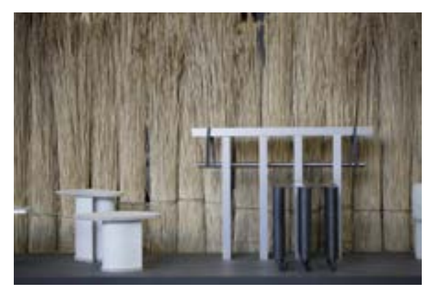
Milk Decoration Café, M&O Paris France 2018